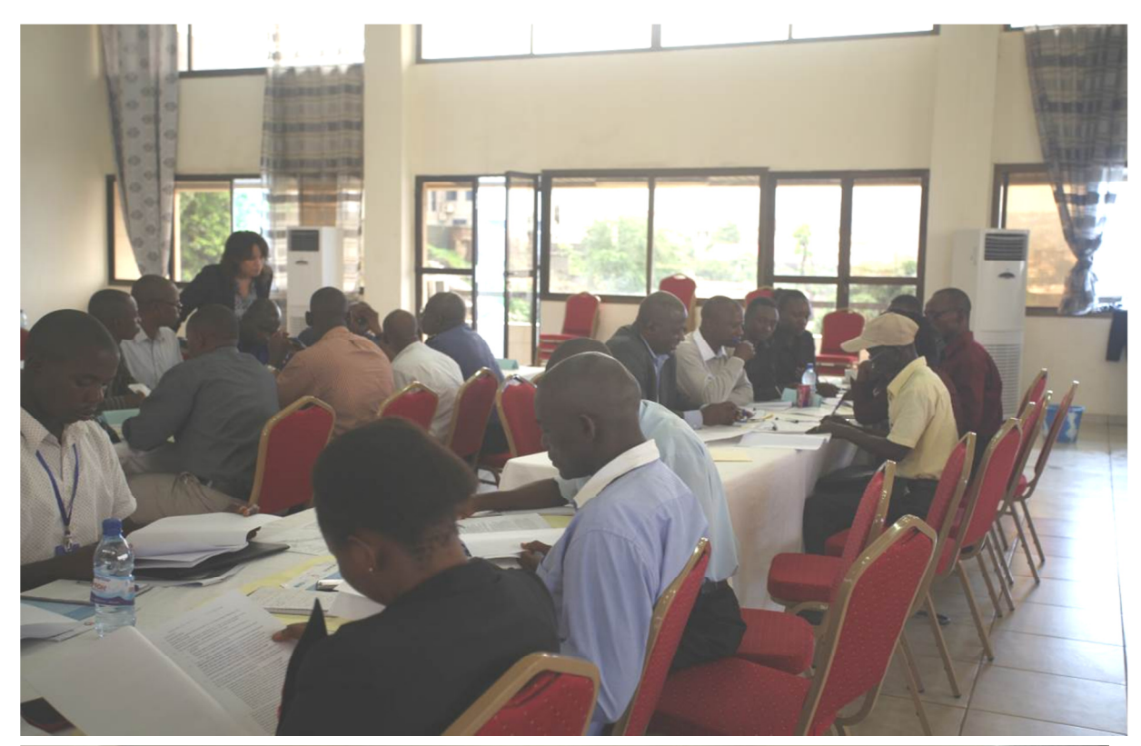
Syndicate Work - Table top Exercise