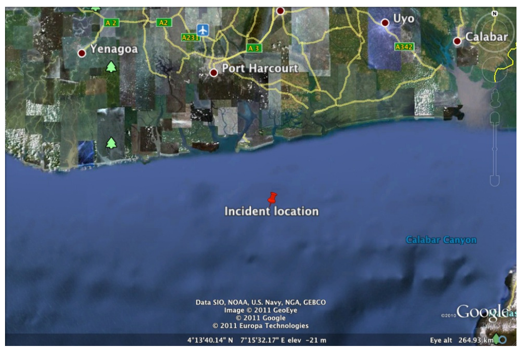
Figure 1: Incident location

The exercise was launched using the existing notification process in Nigeria i.e. calls were placed by the ship captain to NIMASA through the MRCC in Lagos while the FPSO workers informed the oil operator of the incident. Eventually, both organisations informed NOSDRA of the situation. Injects were used throughout the exercise to simulate various issues and preoccupations one must usually deal with during an incident.