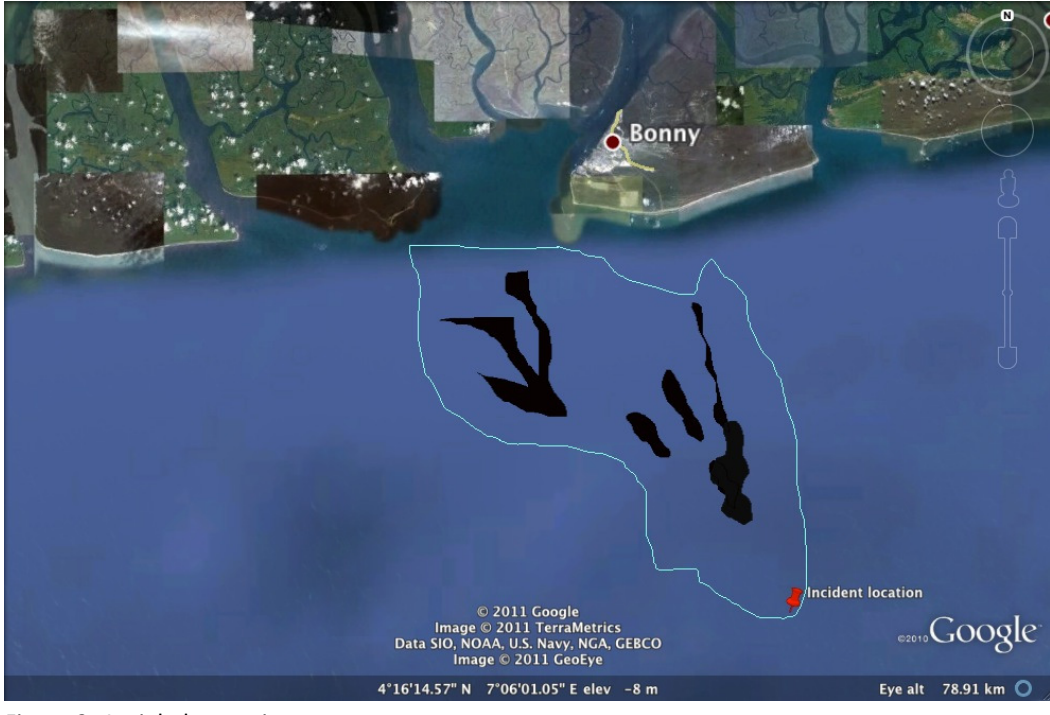
Figure 2: Aerial observation report

Aerial observations were also generated to provide an estimate of oil trajectory according to weather conditions and oil type.