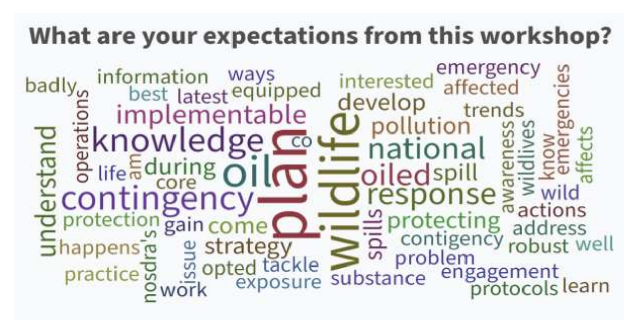
Session 2: Introduction to Oiled Wildlife