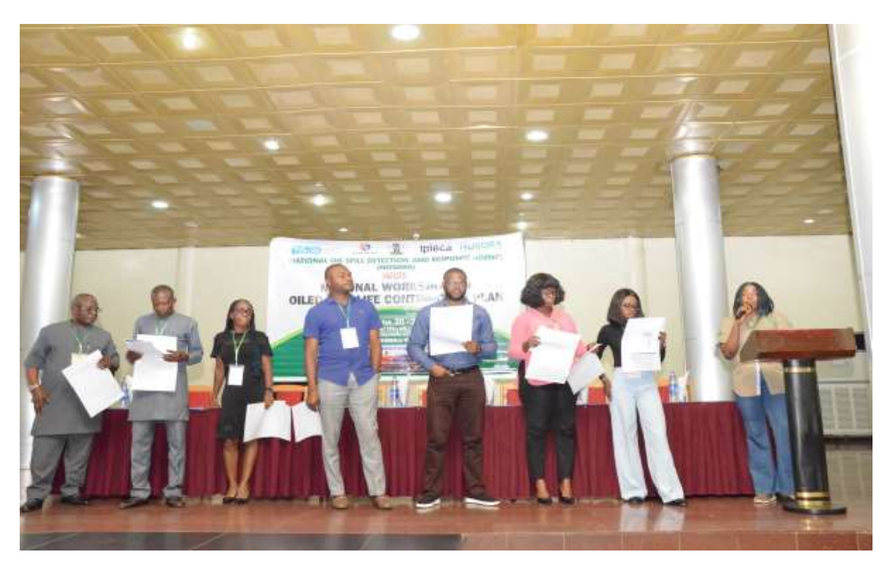
5.2.4 Day 4